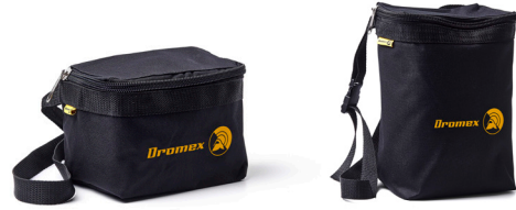
MIDI MASK BAG CODE: DHRB-BLK

Packed as one set (2) of cartridges shrink wrapped in a polybag, preventing contamination. Filters should be stored in a dry, cool environment, away from direct sunlight and contamination. When not in use or during transportation this filter should be stored in a container, the Dromex® half or full-face mask storage bag or in the packaging provided out of direct sunlight and in dry conditions away from chemicals and abrasive substances to avoid physical contact / damage of any kind.