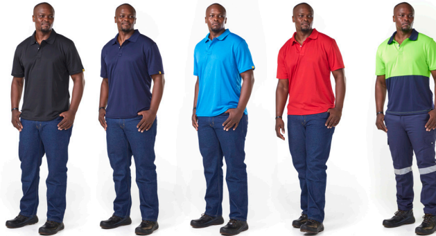
DW-TECH-GBK DW-TECH-GNB DW-TECH-GRB DW-TECH-GRD DW-HVTECH-GLNB

Style: Short sleeve collared shirt with two button closure Fabric composition: 100% Polyester Mass: 140gsm