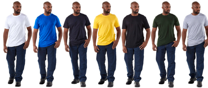
DW-TSHIRTWHT DW-TSHIRTRB DW-TSHIRTNB DW-TSHIRTYL DW-TSHIRTBK DW-TSHIRTBG DW-TSHIRTGY

Style: Round neck, short sleeve t-shirt. Fabric composition: 100% Combed cotton. Mass: 165gsm.