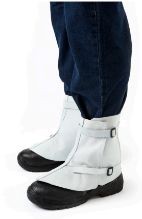
DH ANKLE SPAT