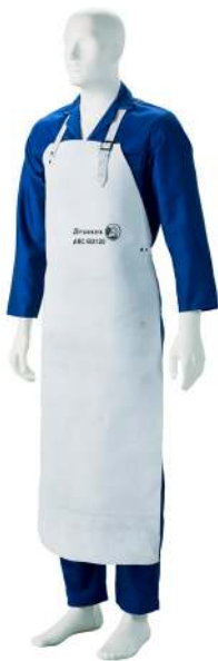
ACE ONE 60X120