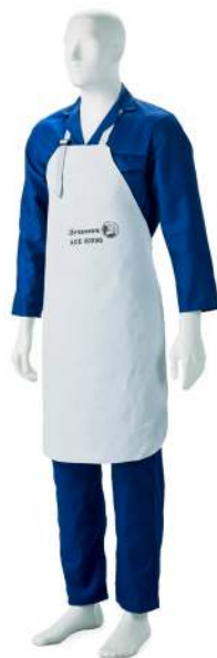
ACE ONE 60X90